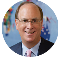
Larry Fink Chairman and Chief Executive Officer